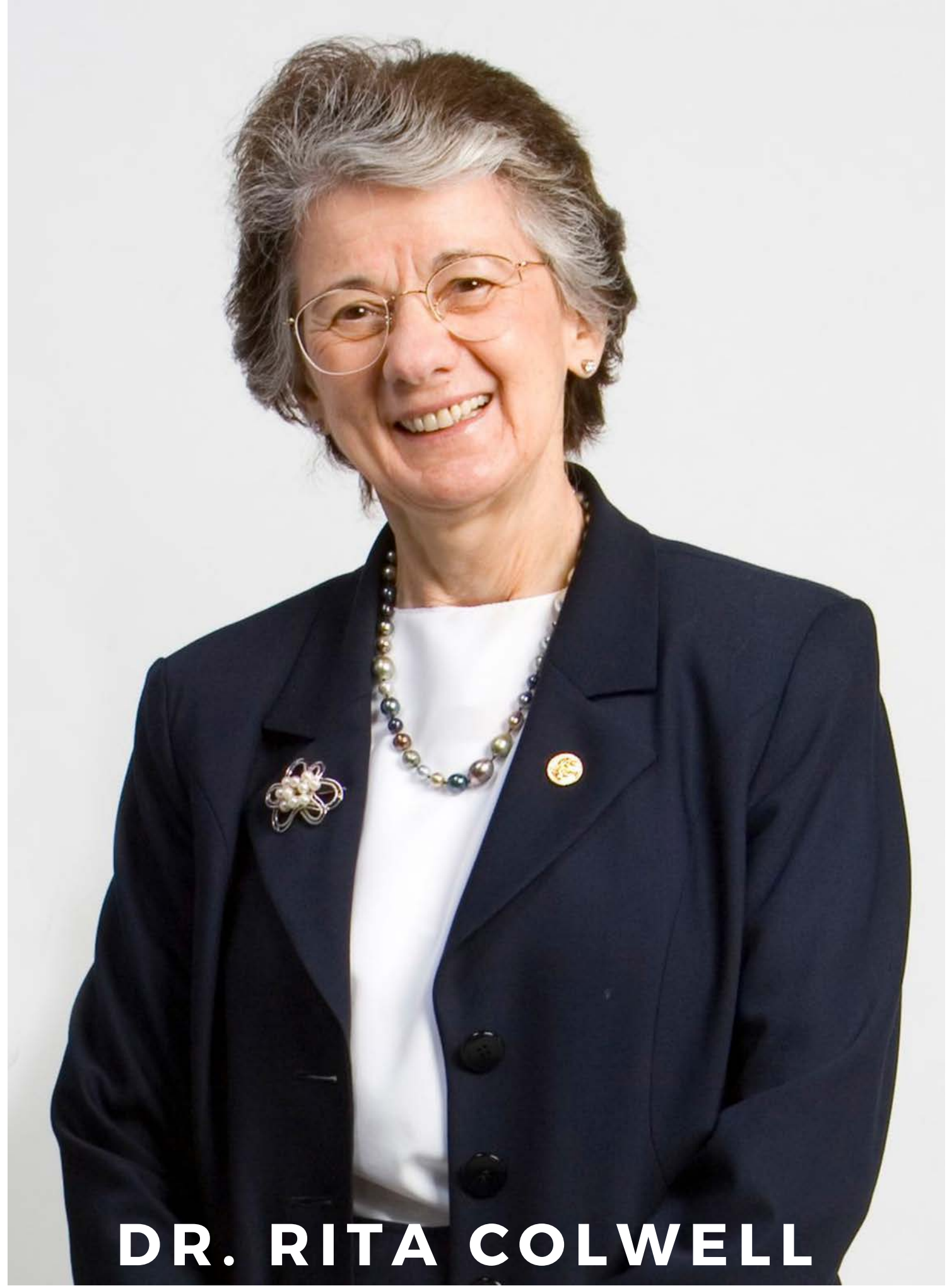
DR. RITA COLWELL

JANUARY 21 @ 4 PM THE ROTUNDA Reception to Follow